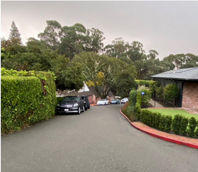
Figure 3: Narrow Streets with Parking on One Side