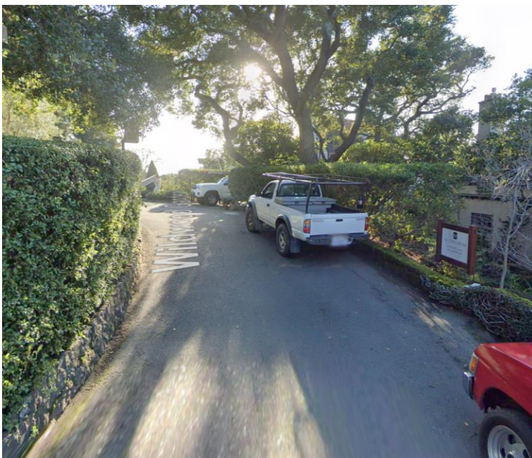
Figure 4: Narrow Portions of Eastern Loop where Parking is Allowed